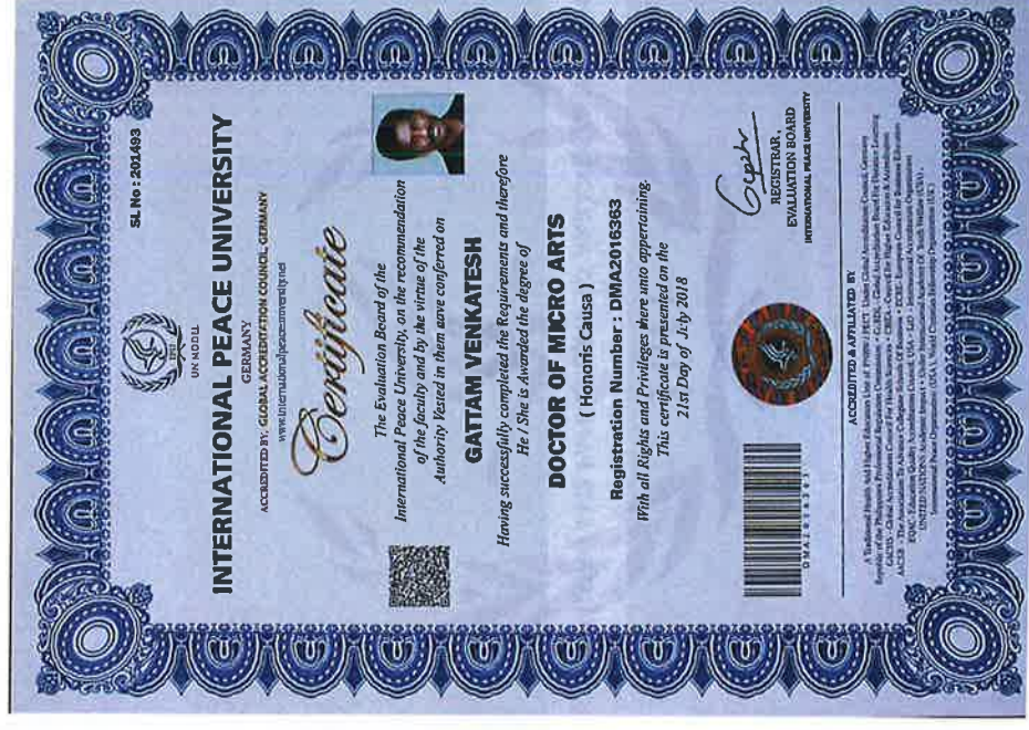
Certificate of honourable Doctorate