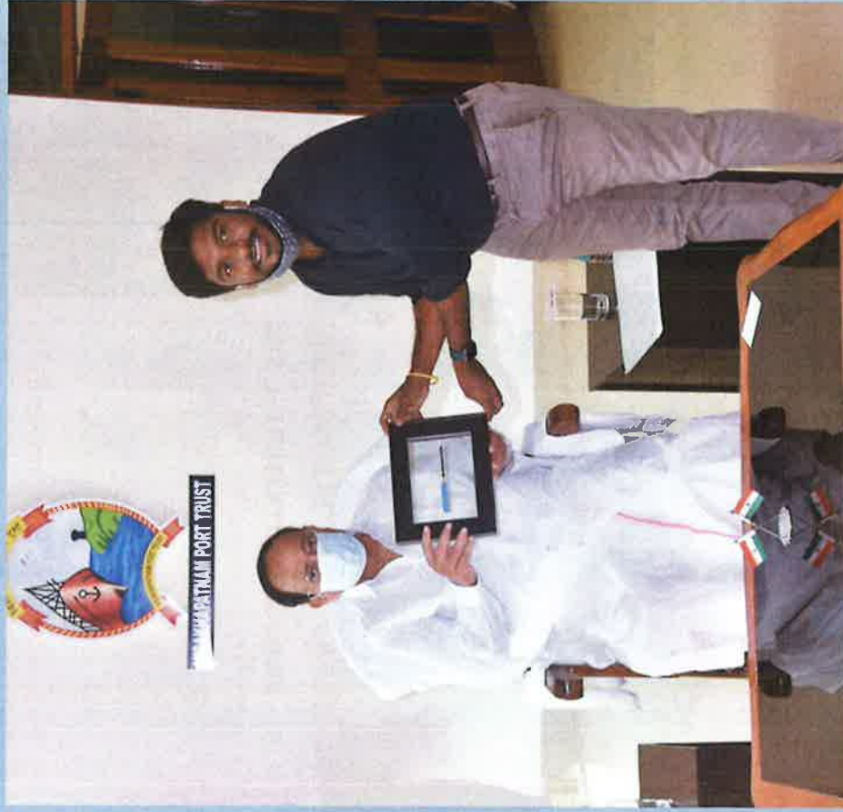
Shri M Venkaiah Naidu garu