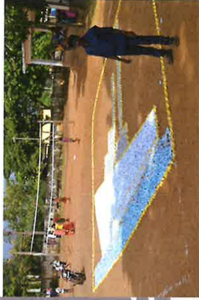
LARGEST SHIP USING 5432 PAPER BOATS TO ARRANGE SHIP SHAPE