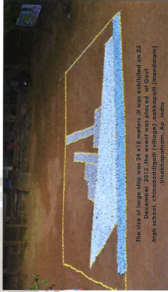
The size of large ship was 24 x 18 meters .It was exhibited on 23 December 2013 .The event was placed at Govt high school, chinadoddigallu (village), nakkapalli (mandalam), Visakhapatnam, Ap, India